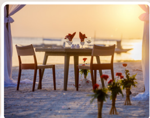
WEDDING VENUE DIRECTORY ... 42-43