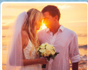
FIVE ESSENTIAL PLANNING TIPS TO MAKE YOUR OUTDOOR WEDDING PERFECT ... 28-29