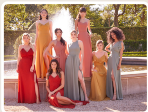
WEDDING TRENDS 2022 ... 33-39