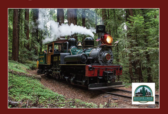
Membership Directory and Tourism Guide